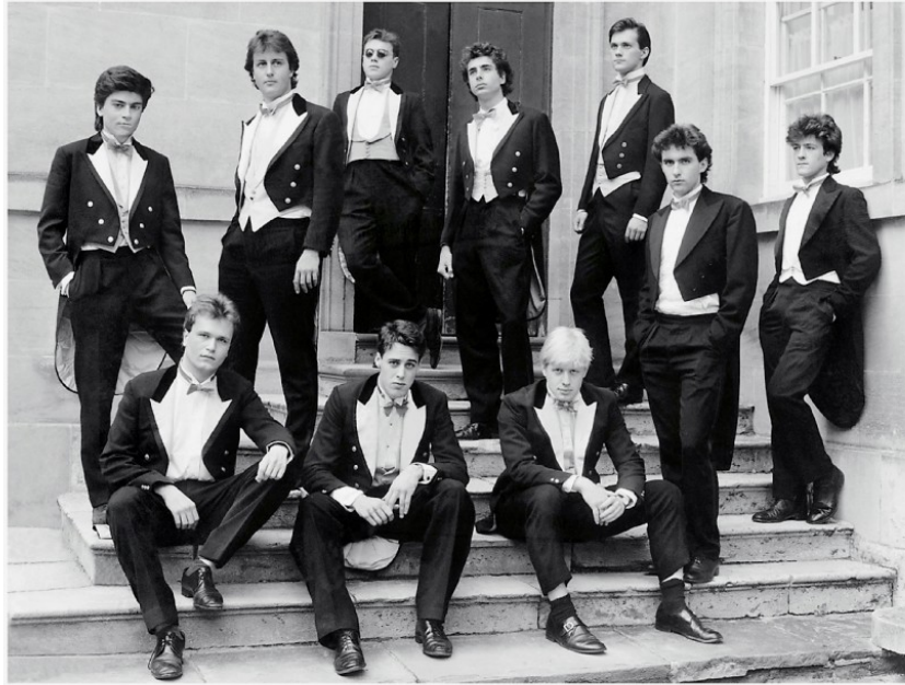
Back row second from left, David Cameron. Front row third from left, Boris Johnson.

The Bullingdon Club is an exclusive society at Oxford University noted for its grand banquets and boisterous rituals, such as the 'trashing' of restaurants and college rooms.